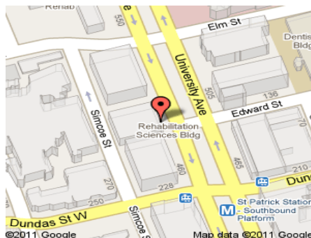
U of T Rehabilitation Sciences Building (500 University Ave. Rm. 140, Toronto)